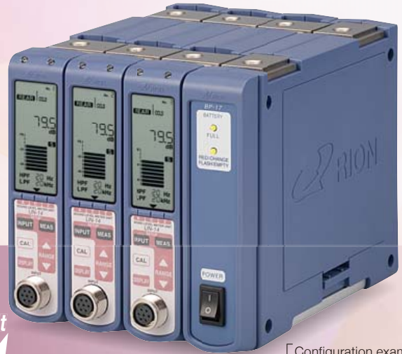
Configuration example showing three UN-14 units with BP-17

Accommodates a range of measurement microphones and various preamplifiers including types with TEDS compliant input.