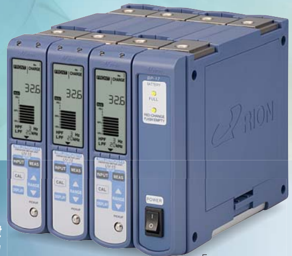
Configuration example showing three UV-15 units with BP-17

Provides connectivity for piezoelectric accelerometers, accelerometers with integrated preamplifier, and TEDS compliant accelerometers.