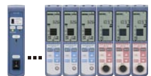
UV-22 UV-15 UN-14