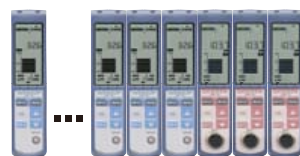
UV-15 UV-15 UN-14