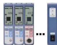
UV-15 UN-14 BP-17